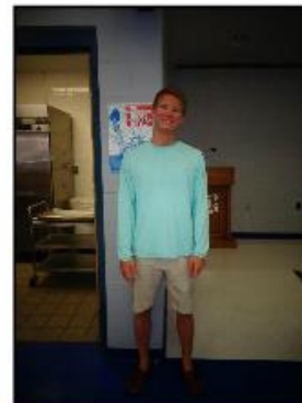
"Since I dye my hair almost every week, I usually try to match my hair with my outfit."